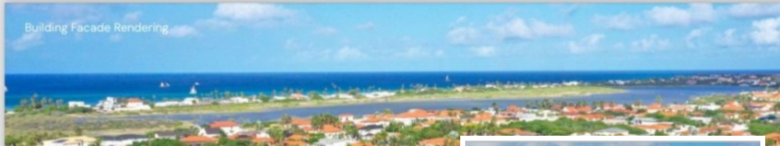
Building Facade Rendering